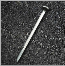
14" Steel Spike Asphalt