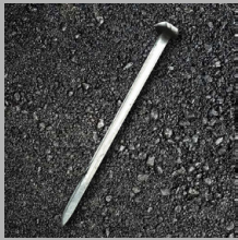
14" Steel Spike Asphalt