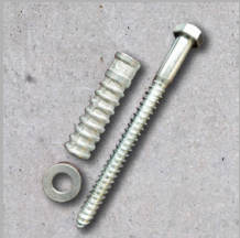
5" Expansive Screw Concrete